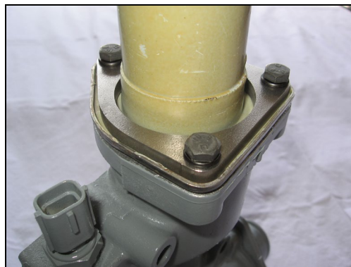
T-Stat Housing and Ring Fully Installed