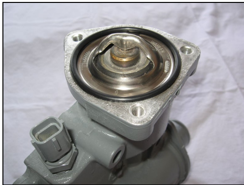
T-Stat and New O-Ring in Place

Congratulations on completing the installation of the Driven Diesel T-Stat Housing Reinforcement Ring Kit.