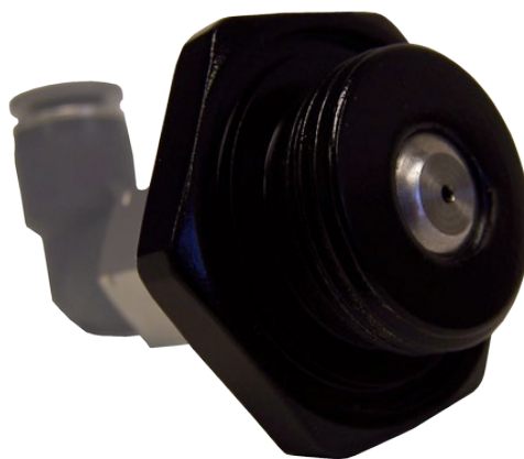
Properly Installed Nozzle